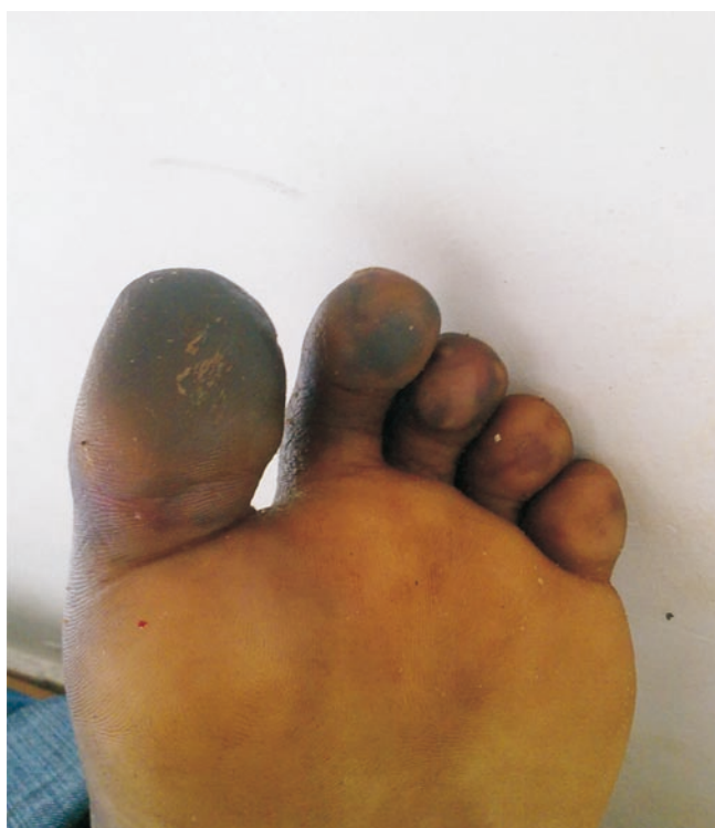
Figure 3. Left foot of patient at follow-up 2 weeks after discharge revealing poorly demarcated dry gangrene.