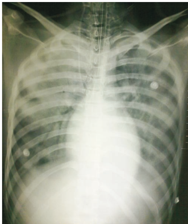
Figure 1. Chest radiograph on day 1 revealing asymmetrical right upper and mid zone alveolar infiltrates with air bronchograms.

Unilateral pulmonary edema is a rare finding. Asymmetrical pulmonary edema is either due to ipsilateral lung or contralateral lung edema. In the first, edema occurs on the side of the lung pathology, for example, aspiration. In the second, a pathology on one side, for example pulmonary embolism, causes pulmonary edema in the contralateral lung [6] . Cardiogenic causes like mitral regurgitation, paravalvular leakage, mitral valvular involvement by malignancy, left atrial myxoma, pulmonary venous compression, unilateral venoocclusive disease and non-cardiogenic factors like the dependent lung in lateral decubitus position, aspiration pneumonitis, pulmonary embolism, injury due to surgery, trauma or lung re-expansion can cause such a finding [6–8] . Two cases of unilateral pulmonary edema due to scorpion envenomation have been reported [2] . Right upper lobe edema has been