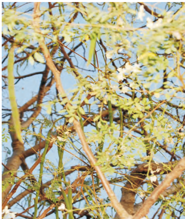
Figure 1. M. oleifera plant

Moringa oleifera ( M. oleifera ) is the most widely cultivated species of a monogeneric family, the Moringaceae, that is native to the sub-Himalayan tracts of India, Pakistan, Bangladesh and Afghanistan (Figure 1).