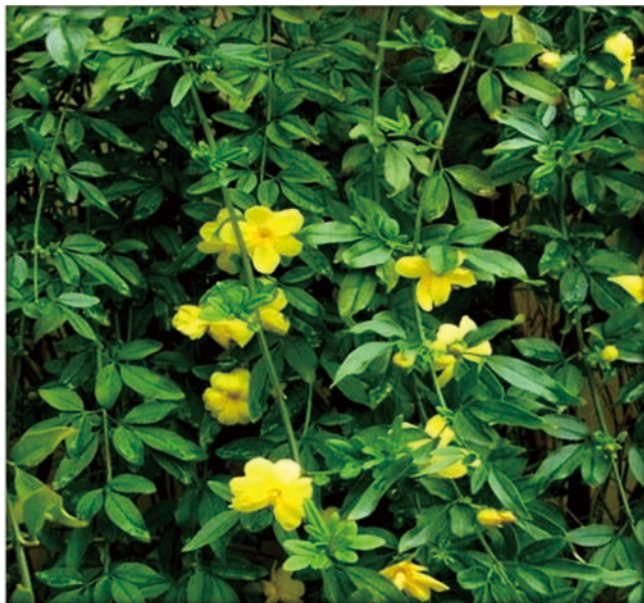
Figure 1. Photograph of Jasminum mesnyi plant.

Figure 1 shows the photograph of Jasminum mesnyi plant.