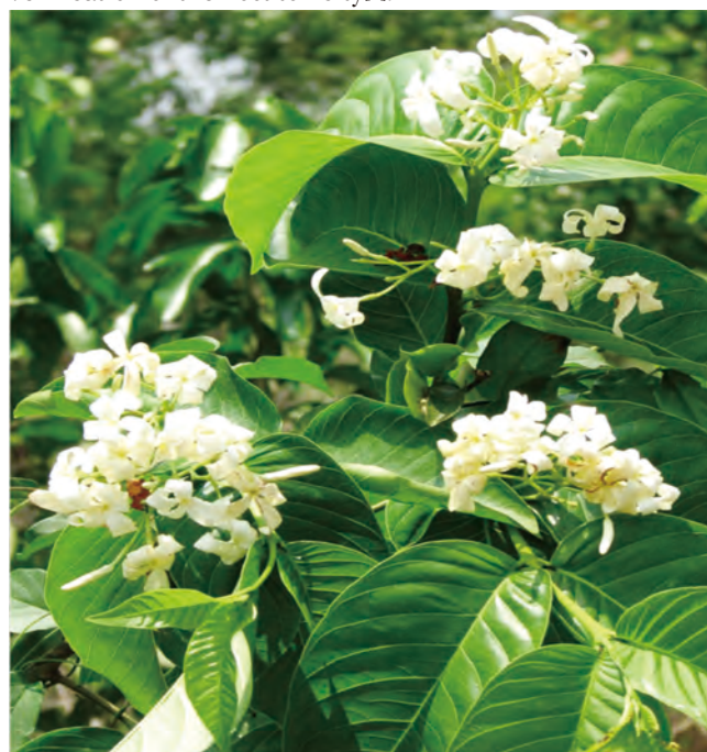
Figure 1. Photo of H. antidysenterica .