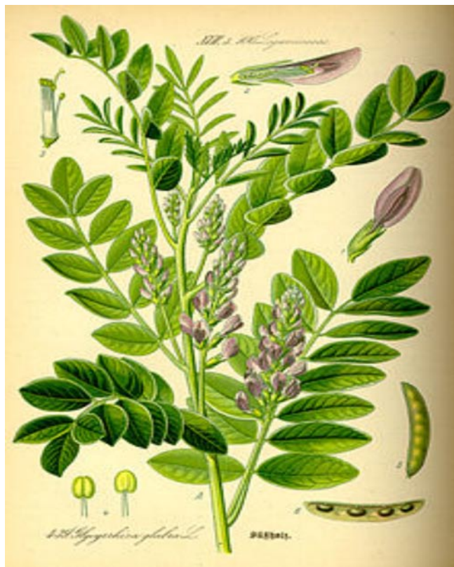
Figure 1. Licorice ( Glycyrrhiza glabra L.).