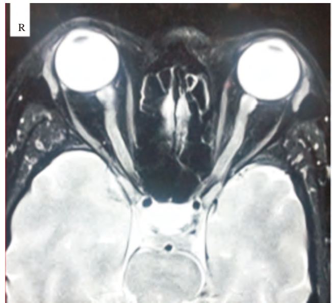
Figure 2. MRI orbits (T2-weighted axial view) showing patchy enhancements of both optic nerve sheaths and slight thickening especially at the retrobulbar portion.

An urgent computed tomography scan of the brain which was performed to rule out any intracranial mass proved normal, while blood investigations for infective and connective tissue screening (erythrocyte sedimentation rate, venereal disease research laboratory, C 3 , C 4 , anti-nuclear antibody, anti-dsDNA and rheumatoid factor) were negative. She had incidental finding of hypochromic microcytic anaemia with low plasma ferritin but normal iron-binding capacity suggestive of iron deficiency anaemia. Magnetic resonance imaging (MRI) of the brain showed patchy enhancement of the posterior aspect of bilateral intraconal optic nerve sheaths (Figure 2). The classical “doughnut sign” of the signal-enhancing optic nerve sheath was seen in both eyes on coronal views (Figure 3). There was no abnormal intracranial white matter enhancement of the brain parenchyma.